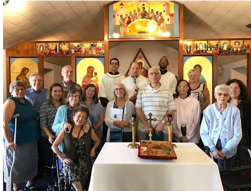
Meet some of the parishioners at Saint Nicholas Parish in Fontana, Ca

identify one or two of these to put into practice each week. Examine your conscience each night, asking for forgiveness from God or others as needed. Find opportunities to share your faith with others.