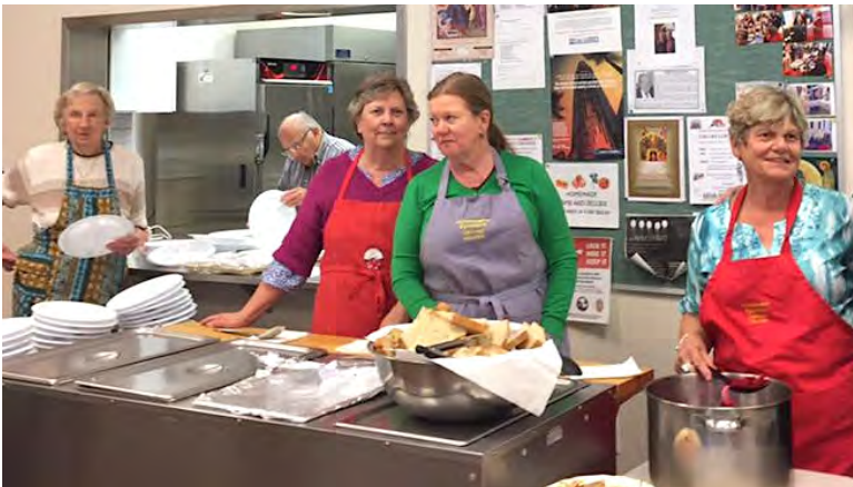
The Food Line and Kitchen Staff—Thank you

July 6-9, ALIVE IN CHRIST: This "ascetical boot camp" retreat is to take place at Prescott Pines Christian Camp, Prescott, AZ. Parish boys from 7 to 17 years of age and their fathers are invited to attend.