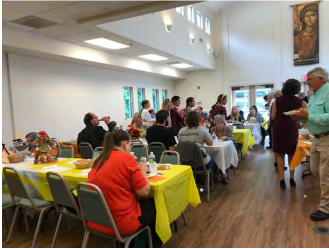
Photos from our October Fest