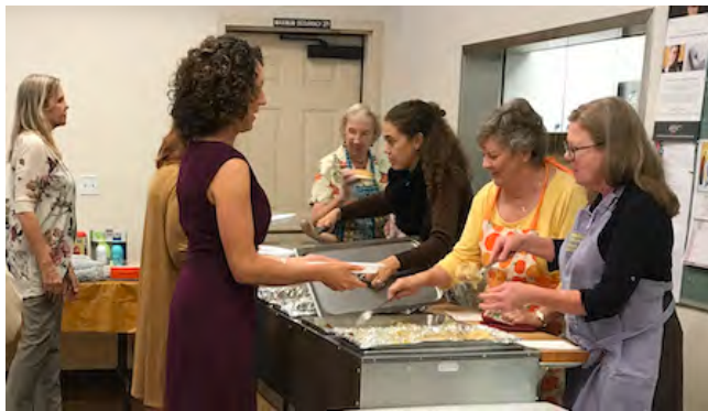
Thank you for making it a success.