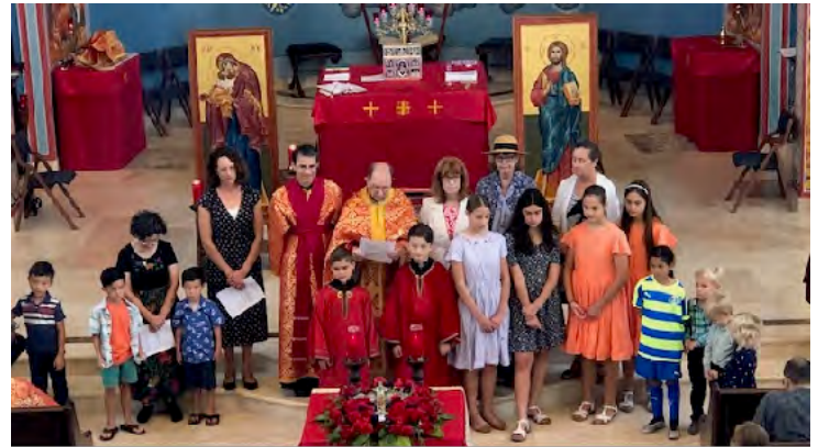
We begin another year for our Eastern Christian Formation Program 2019-2020. Not all our teachers and students are shown in the picture.

How people respond to success is one indication of their true character. Instead of claiming the valuable catch for themselves, Peter and Andrew called their partners to share it. We are not reservoirs, but channels of blessing, to share with others what God has graciously given to us.