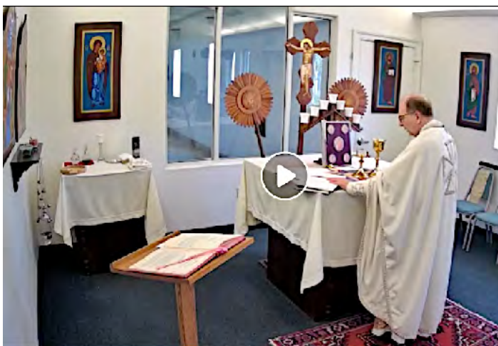
Daily Liturgy in the Chapel