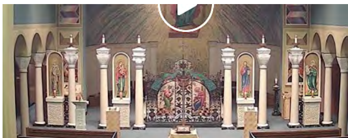
St Elias Byzantine Church in Munhall, Pennsylvania

ONLINE GIVING IS AVAILABLE be sure to select the account (Tithe, Bishop's Appeal etc..) you want your donation to serve. Thank you. Go to our Web page annunciationbyzantine.org click on "donate" or click on tithe.ly or enter it into your browser.